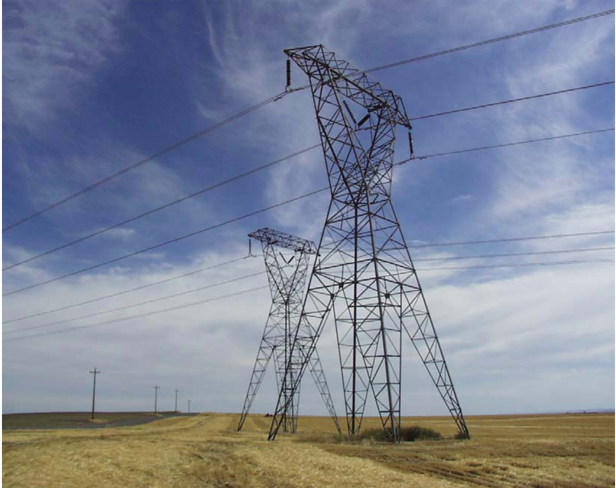
Figure 1.2-1 Wells Project Transmission Line